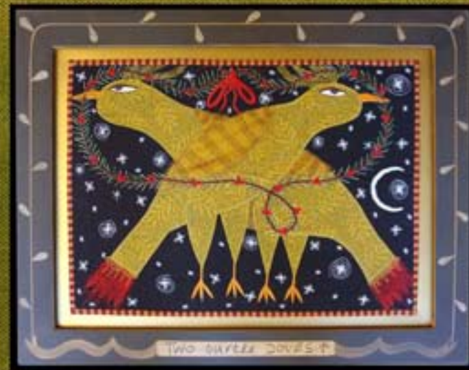
Two Turtle DOVES