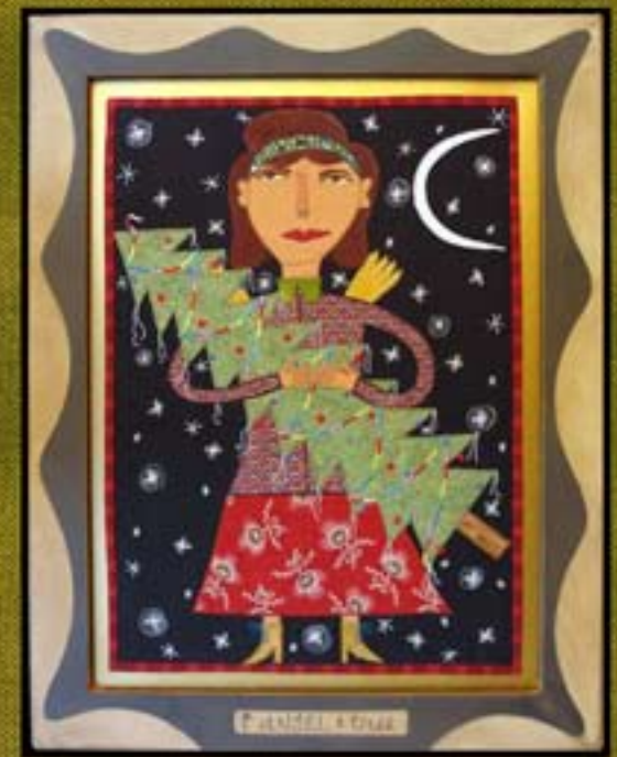
Angel With Tree